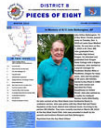
Pieces of Eight - Winter 2015